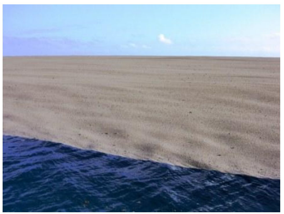
A floating shore has appeared and they go for a closer look.