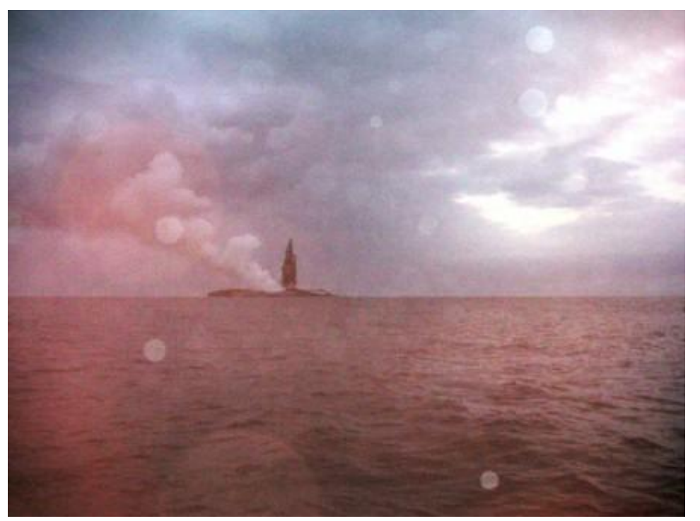
Lucky to be a witness and live to tell the tale, the crew of the Maiken thank their lucky stars and bid the infant island a fond farewell.