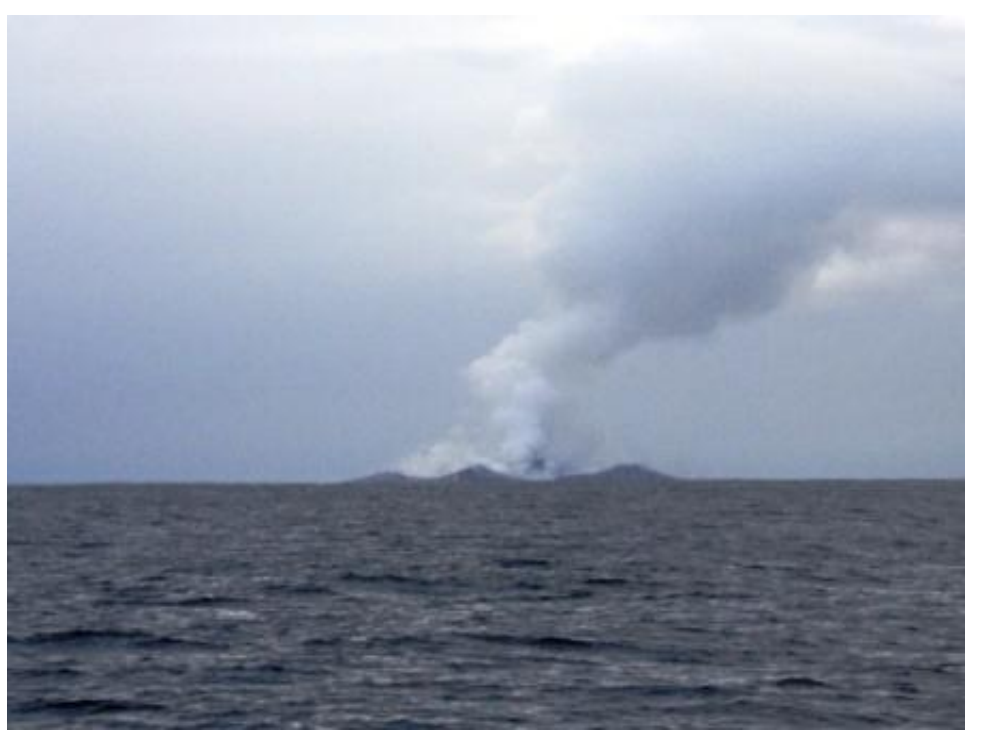
From a safe distance their fears are confirmed, they had sailed over an active underwater volcano!