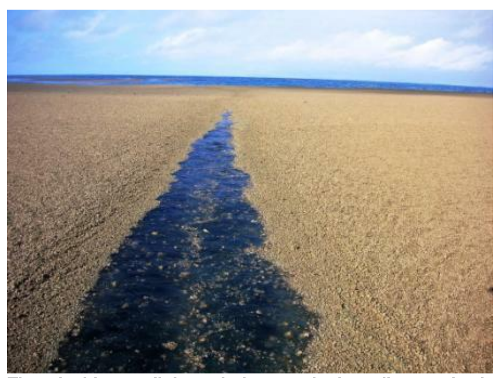
They decide to sail through the seemingly endless rocks, leaving a wake behind them. Their ship slows to a crawl as they venture into the mass.