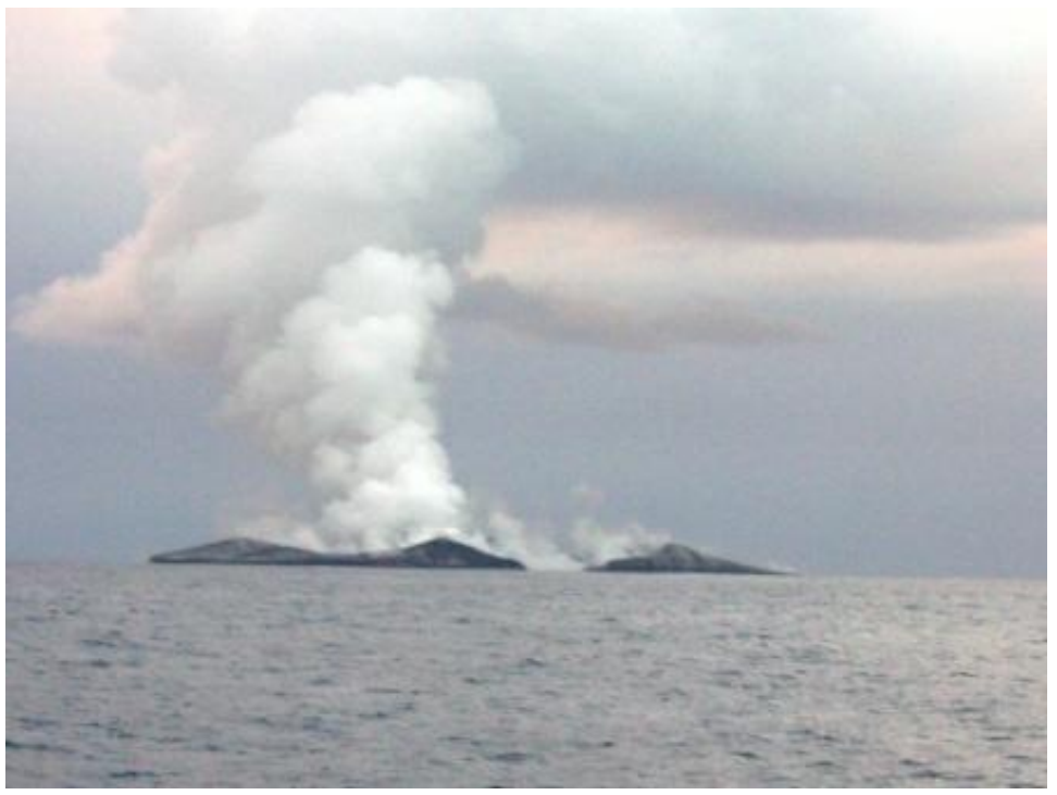
They stayed to watch one of mother nature's rarest wonders.