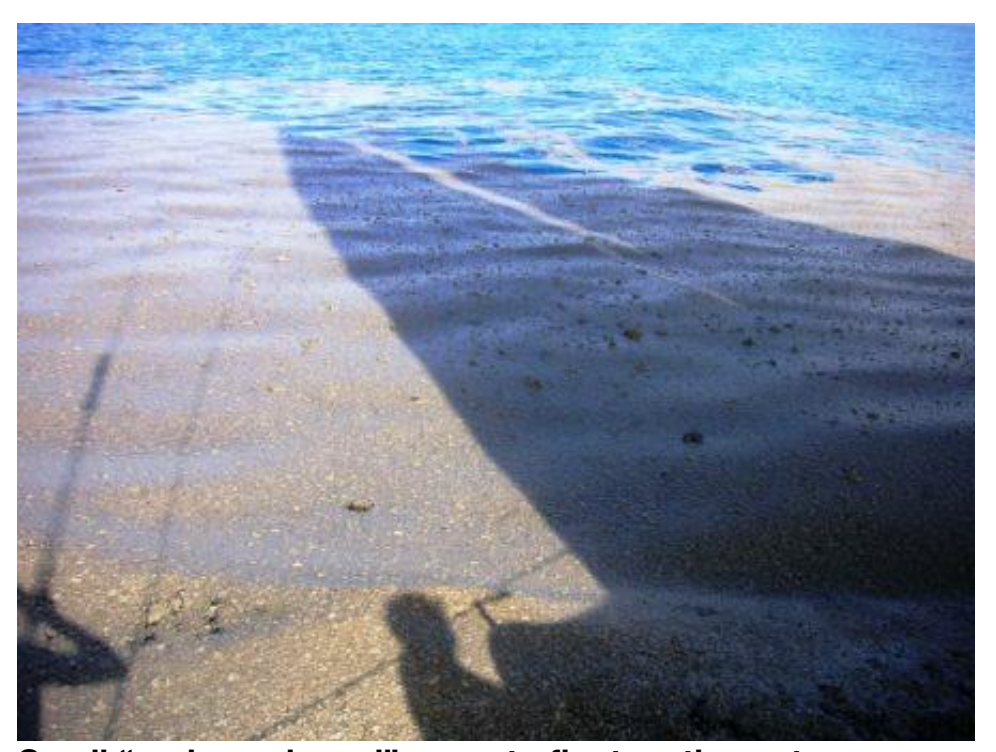
Small "rocks and sand" seem to float on the water.