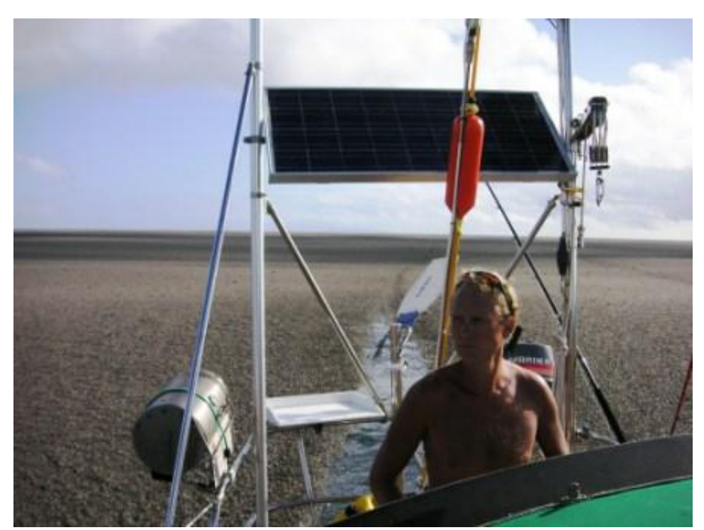
Their ship has become blocked with pumice. They clear the stones and manage to restart the engine.