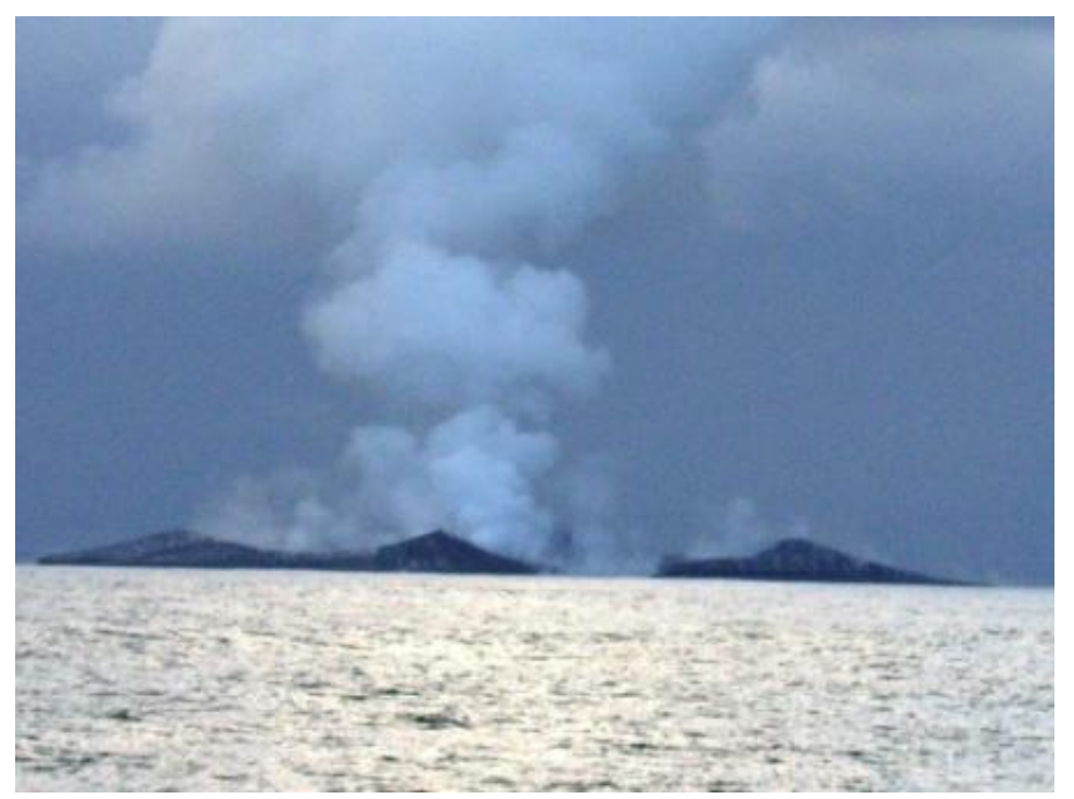
Sure enough, the raw island surface clearly stands out between the water and sky.