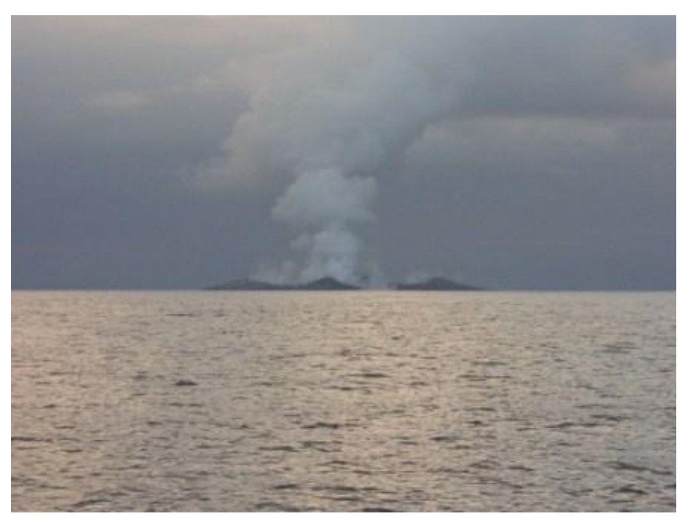
Once everything seemed safe, they risked going in for a closer look.