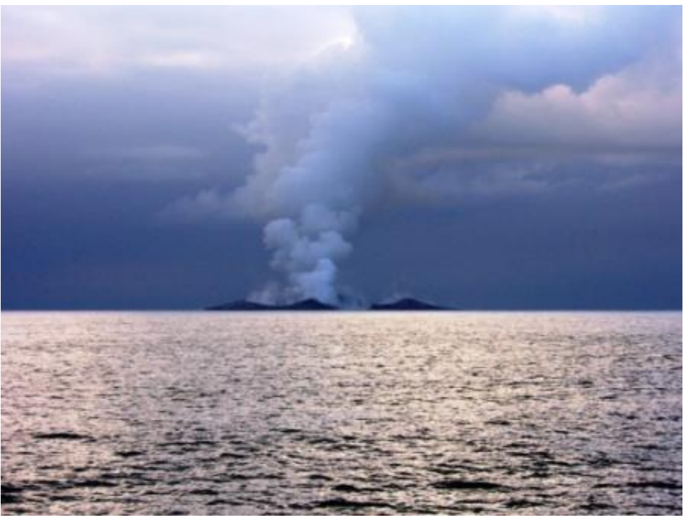
The crew stops to watch the birth of a new island.