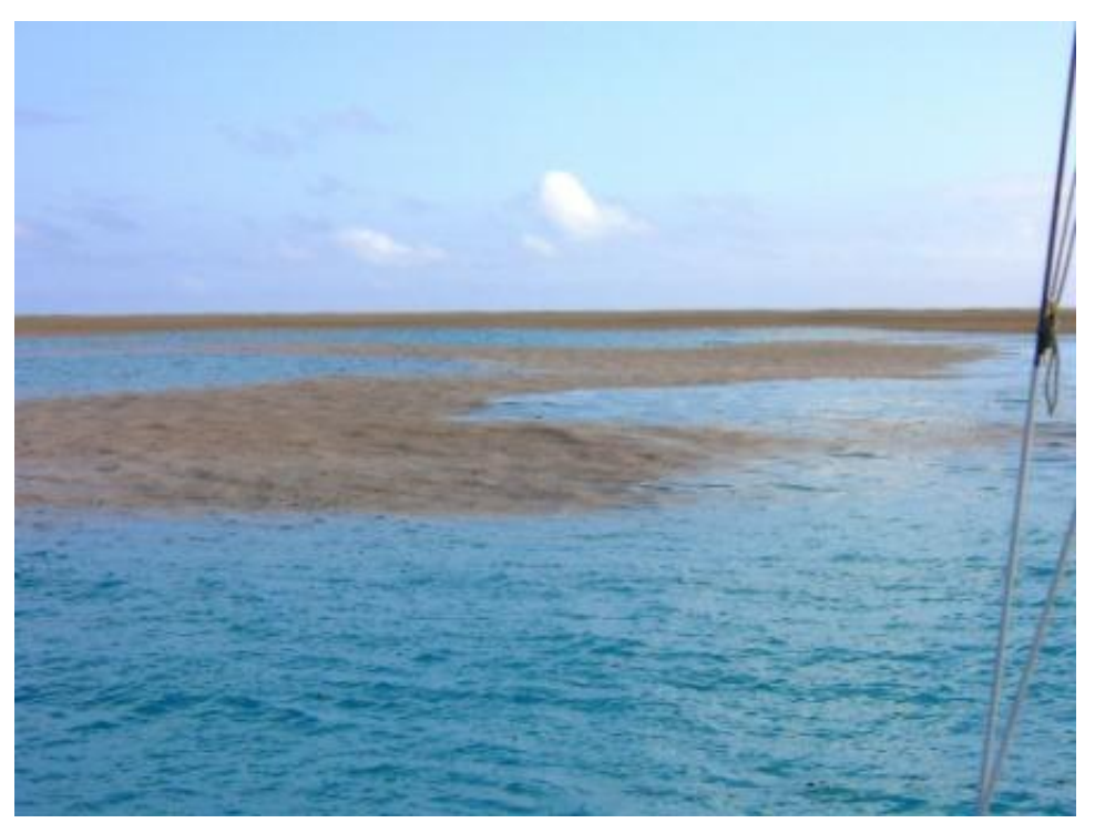
The strange shadow becomes clear as they approach.