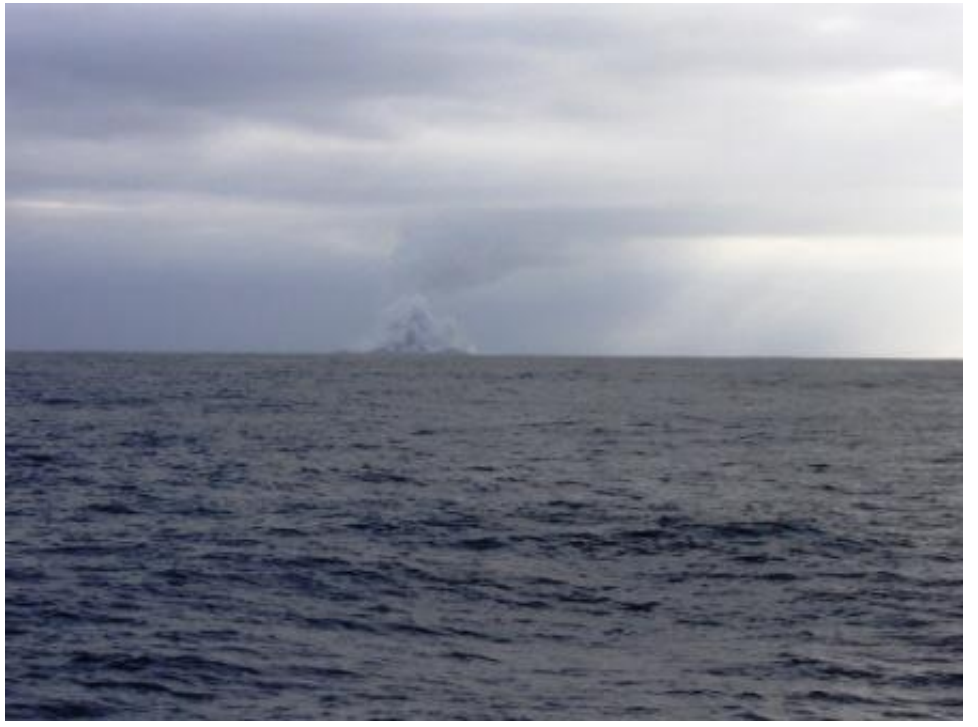
Not long after their departure, they begin to hear a rumbling.