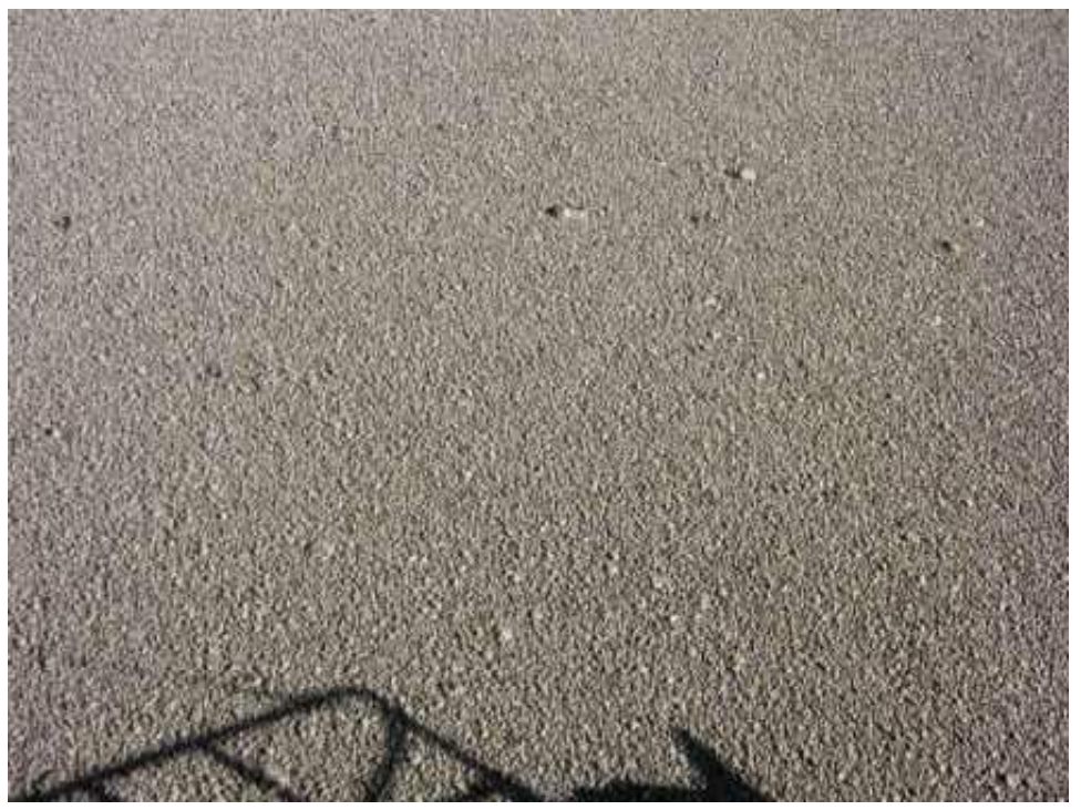
A thin layer of pumice has blanketed the ocean, almost like a floating beach.