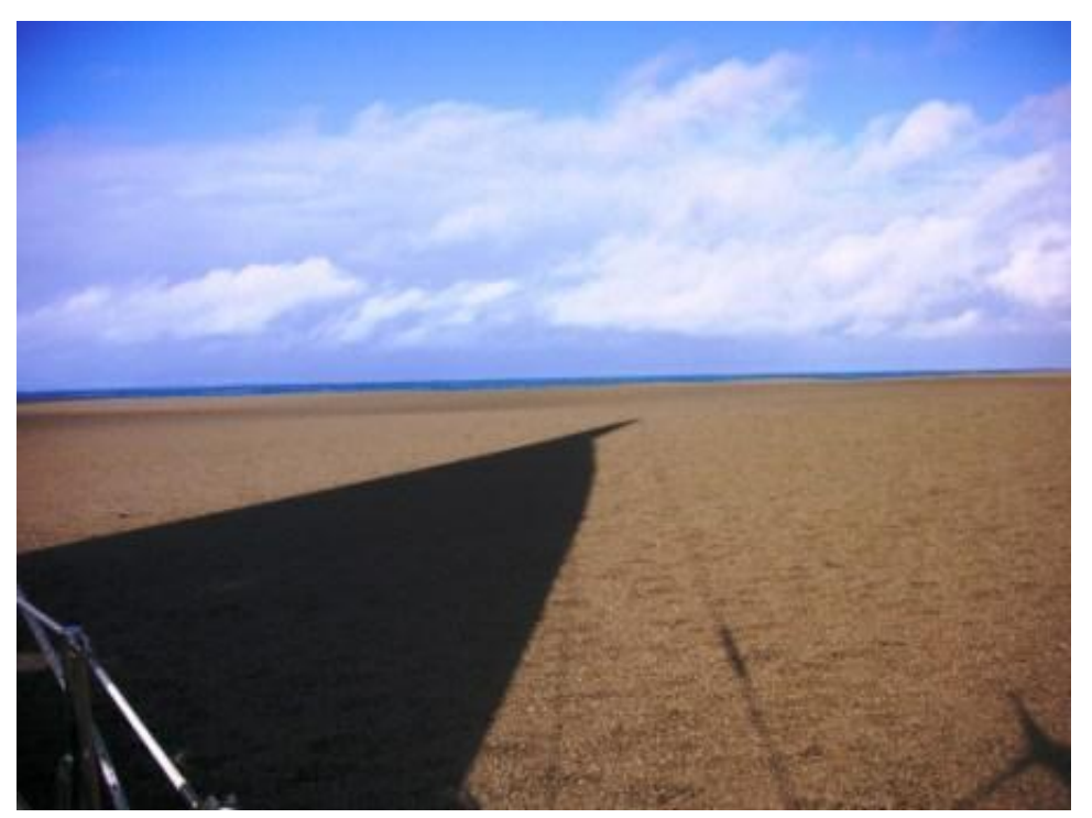
As they sail, the crew notices the "floating beach" is continuing to expand at a rapid rate. Everyone becomes concerned and they decide to make a hasty exit.